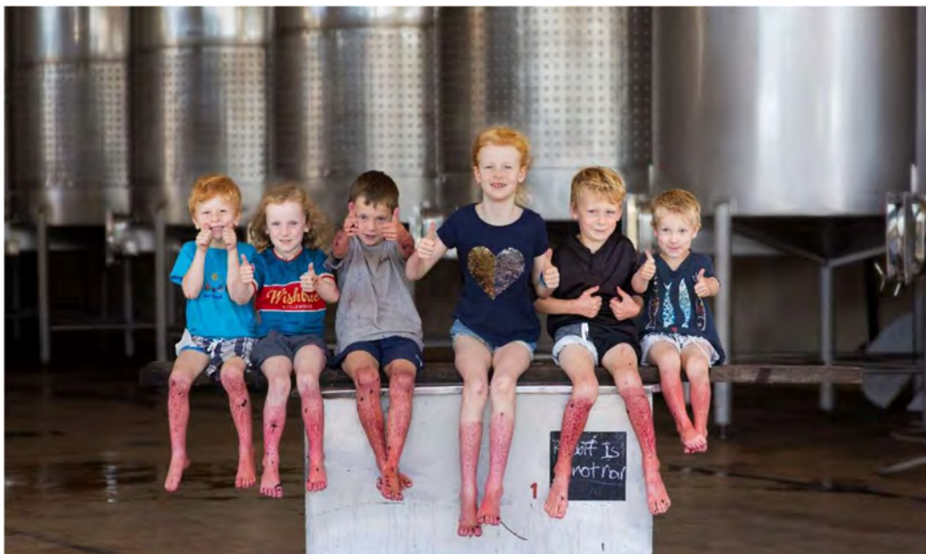
The third generation of Seifried family carry on the legacy during this year’s harvest.