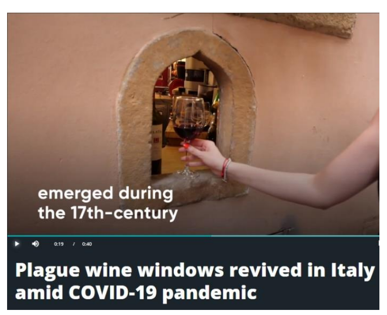
WOW! Just imagine these on the streets on the way to work, or the way home

Instead of launching the club's 40th birthday celebrations, this event will wrap them up so come along and make it a great day to mark this special milestone.