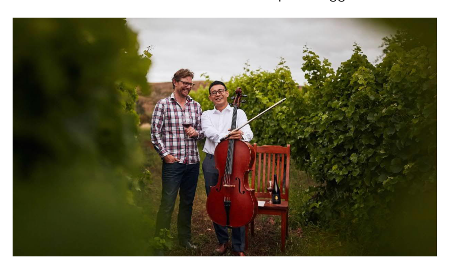
(Ed. Everything goes better with wine does it not.)