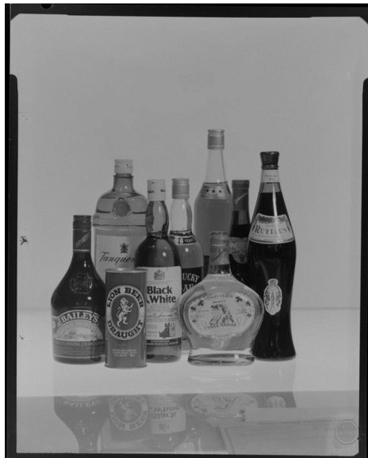
Liquor bottles - 1978

Bottles were hidden and the customers protected, but there were a couple of nights when the police visited repeatedly, every hour or two, with several policemen marching through the restaurant looking for the evidence. It wasn't good for business.