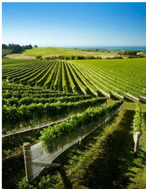
A Hawkes Bay vineyard

A warm summer benefitted New Zealand’s winegrowing regions, with 419,000 tonnes of grapes harvested during Vintage 2018. This is up 6% on the 2017 tonnage, but is still lower than initially anticipated in a season marked by a very early start to harvesting.